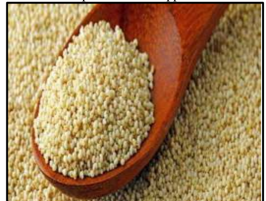
Fig. 7: KhusKhus

KhusKhus is an oilseed obtained from the poppy flower. Poppy seeds (KhusKhus) have strong anti-inflammatory ability, and thus actively used in Ayurvedic preparations for treating inflammation. This magical seed treats sleep disorders like insomnia. If insomnia occurs due to emotional issues such as anger or distress, these can also be treated with Khus Khus. It scores high on several accounts like dietary fibre, minerals (calcium and iron), vitamins, and omega-6 fatty acids. This herb has medicinal properties and thus used in bath soaps for external application.