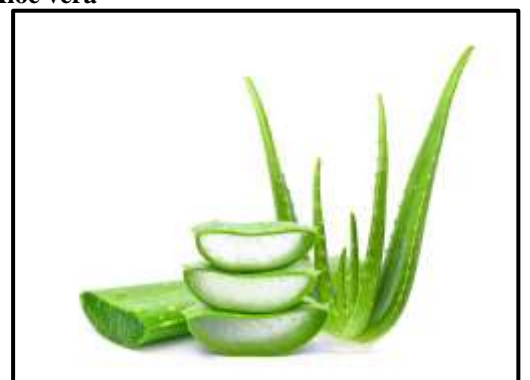
Fig. 3:Aloe vera.

The word aloe Vera means "aloe meaning shining bitter substance while "vera" means true. Aloe Vera contains vitamin A and C and it is also shows anti-inflammatory properties. Aloe Vera belongs to family "Liliacae and commonly known as Ghritkumari. Aloe Vera used as moisturizing and softening agent on skin. The aloe gel gives cooling effect on skin it has role in rejuvenation of aging skin, Aloe Vera has been used for variety of medicinal purpose. Aloe Vera also be used as a moisturizer.