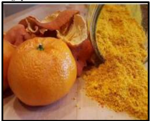
Fig. 5: Orange peels

Orange is a citrus fruit which contains different nutritional source like vitamin C. It also contain calcium, potassium and magnesium. It prevents the skin from free radical damage, skin hydration and oxidative stress. Also it has instant glow property, prevent acne, wrinkles and aging.