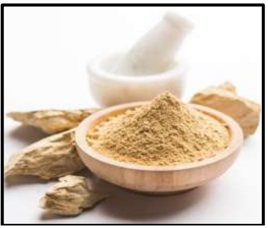
Fig. 6: Multani mitti

Multani mitti helps skin in different ways like minimise pore sizes, removing blackheads and whiteheads, cleansing skin, improving blood circulation, reducing acne and gives a glowing effect to a skin as they contain healthy nutrients. Multani mitti is rich magnesium chloride.