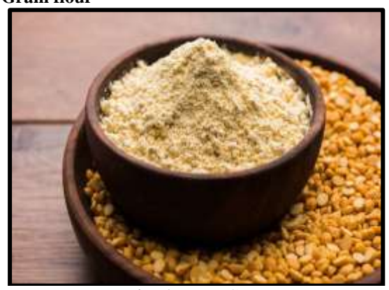
Fig. 6: Gram flour

Gram flour is good for acne-prone skin and can help to lighten any acne scars. It can also be applied all over the body to remove dark spots. It has been used as a base in preparation of herbal scrub.